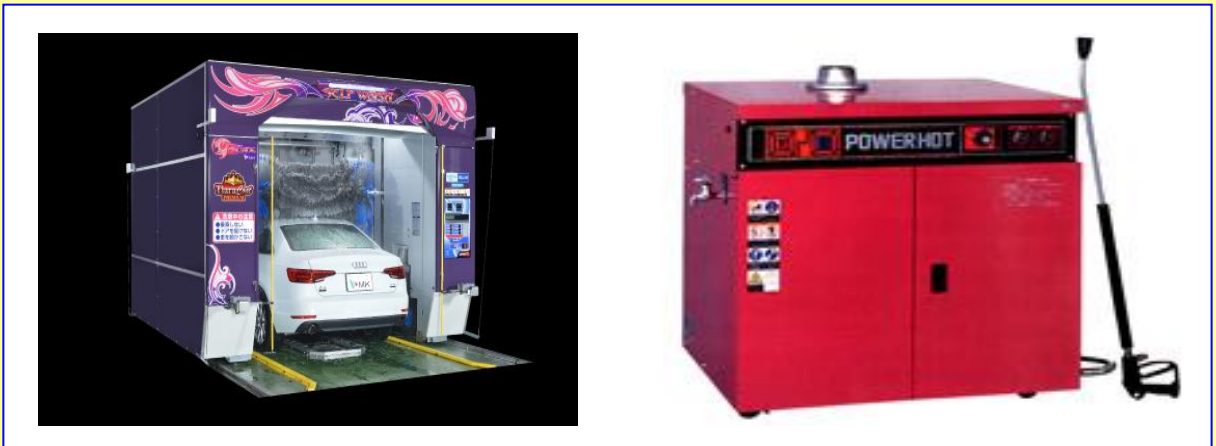
(WASHER) GATE TYPE WASHER, HOT WATER CAR WASHER