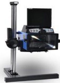
(TESTING AND INSPECTION) SPEEDMETER TESTER, HEADLIGHT TESTER