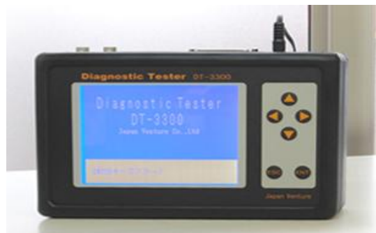
(ELECTRICK) SCAN TOOL {AUTOMOTIVE DIAGNOSTIC TOOL}