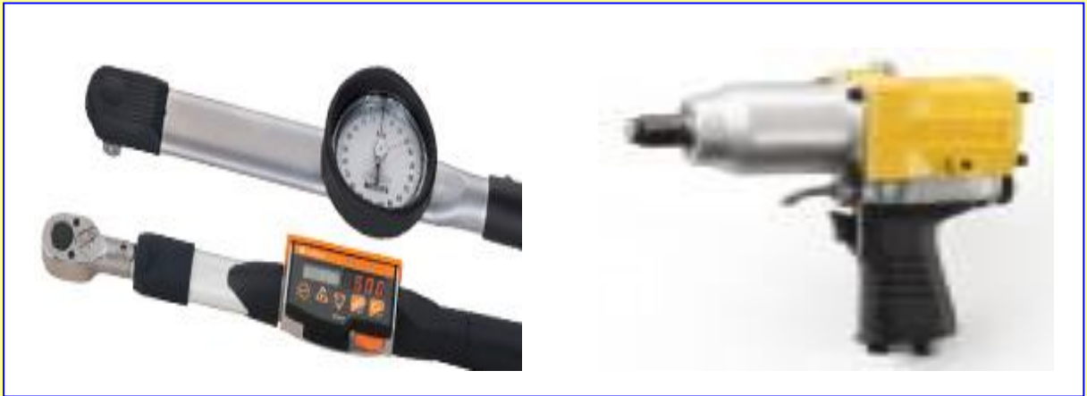
(SERVICE TOOLS) TORQUE WRENCH, AIR TOOLS